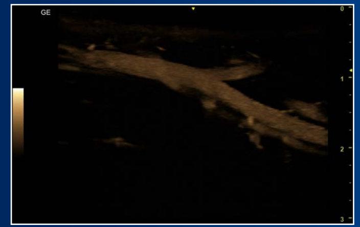
Sensitive B-Flow<sup>™</sup> and B-Flow color imaging to analyze blood flow, vessel-wall irregularities and stenosis, and more.

Whizz one-touch dynamic image tuning constantly optimizes images as you scan, even as you move from one organ or region to another. You also get proven functionalities found on advanced GE Healthcare systems.