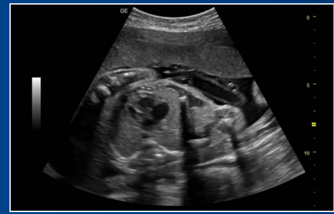
CrossXBeam™ and SRI-HD to define structure borders clearly.