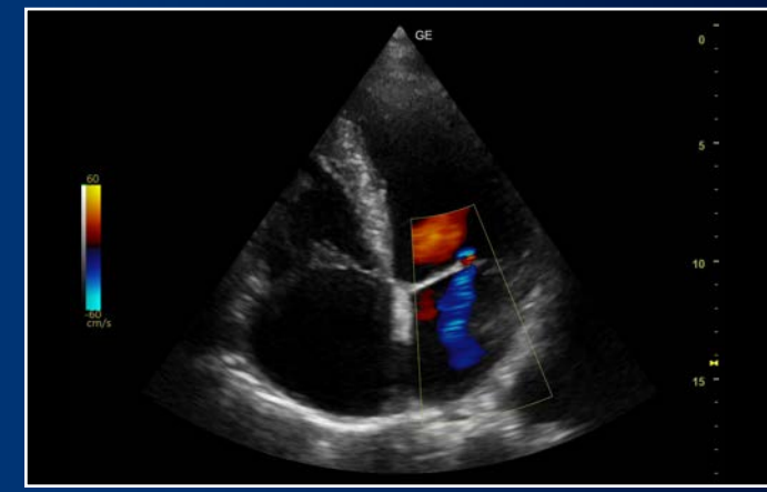
Sensitive color Doppler to examine thyroid vasculature and blood flow in vessels.